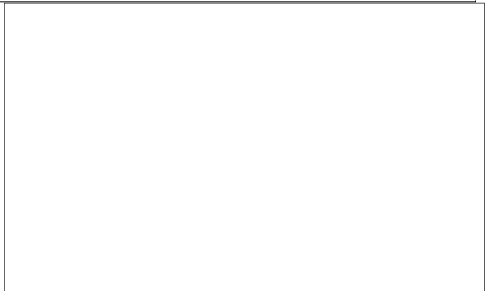
FOP Picnic - This year we combined our picnic with the State FOP picnic. We had a good turnout and everyone enjoyed themselves. See photo above for some of the participants.